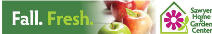
( https://www.moodyonthemarket.com?bannerclick=16671&locationId=55/ )

If you'd like to learn more about this award-winning team, click this link: http://www.swmpc.org ( http://www.swmpc.org ) or you can call them at 269-925-1137.