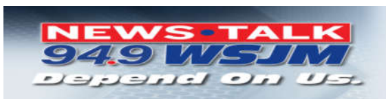
( https://www.moodyonthemarket.com/10-02-18-moody-on-the-market-daily-update/ )