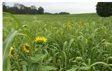
Cover crop - cocktail mix (drilled August 2015).