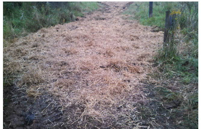
After: The drainage pipes were removed eliminating the direct connection between the wetland and the Eagle Lake Drain. This restoration reduces runoff volume and sediment and nutrients loading.