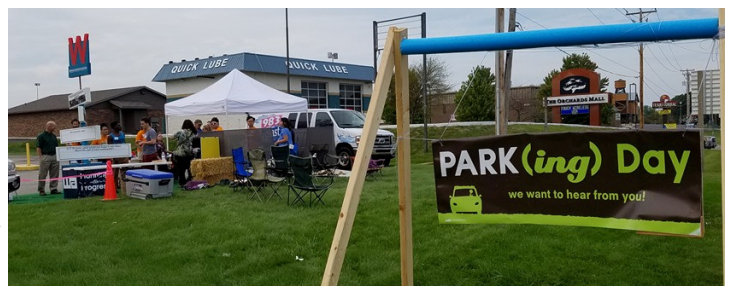
A photo from the PARK(ing) Day Event.