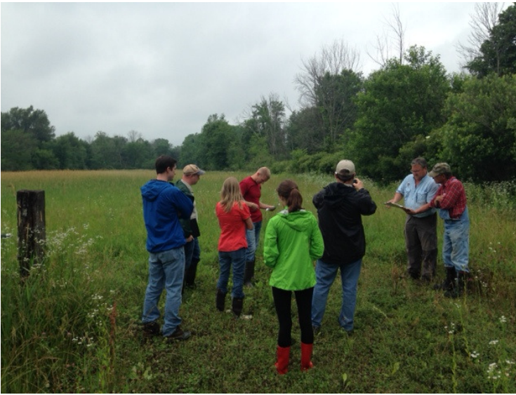
A farmer discussing a wetland restoration/floodplain reconnection and conservation easement on his property with project partners.