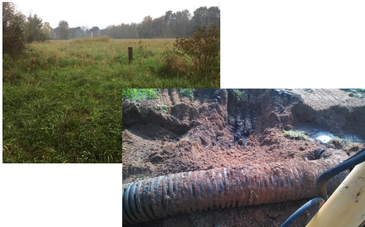
Before/During: This site had three drains connecting a wetland area to the Eagle Lake Drain.