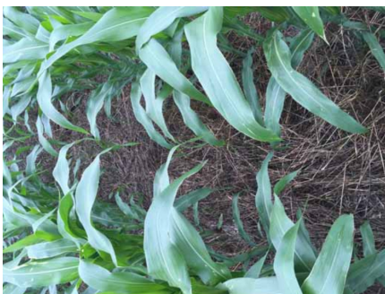
No-Till corn planted into soybean and ryegrass stubble.