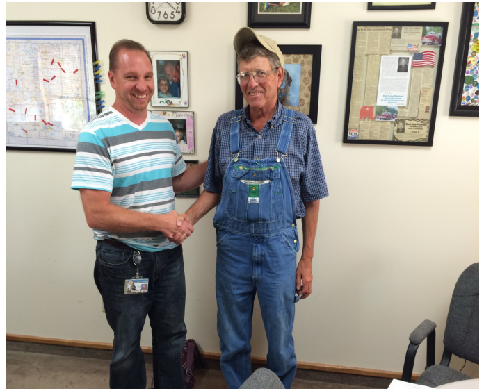
A 22-acre conservation easement signed between a landowner and Van Buren County Drain Office.