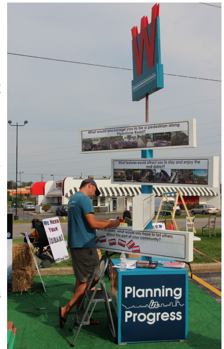
A photo from PARK(ing) Day.

PARK(ing) Day was started in 2005 by Rebar, a San Francisco-based art and design studio. The idea is to challenge people to rethink the way streets are used. Other local communities observing PARK(ing) Day were Benton Harbor and Watervliet. For more information on this project visit: www.swmpc.org/oxcreek.asp