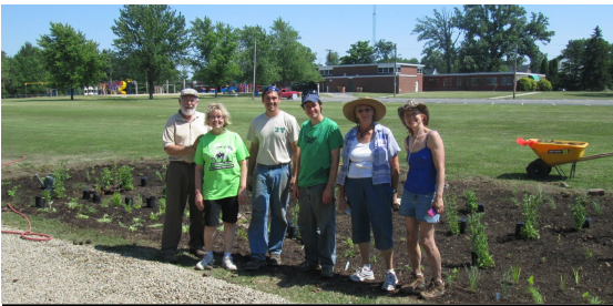
Volunteers at the Three Oaks Rain Garden

Garden in an area that usually floods due to the heavy clay soils. This garden is also located next to an elementary school. An interpretive sign was developed by SWMPC and will be placed next to the newly planted garden to educate the public on the purpose and benefits of rain gardens. Visit www.facebook.com/swmpc for more photos of the Three Oaks Rain Garden Project. The rain garden is located at 2 Oak Street Three Oaks, MI 49128.