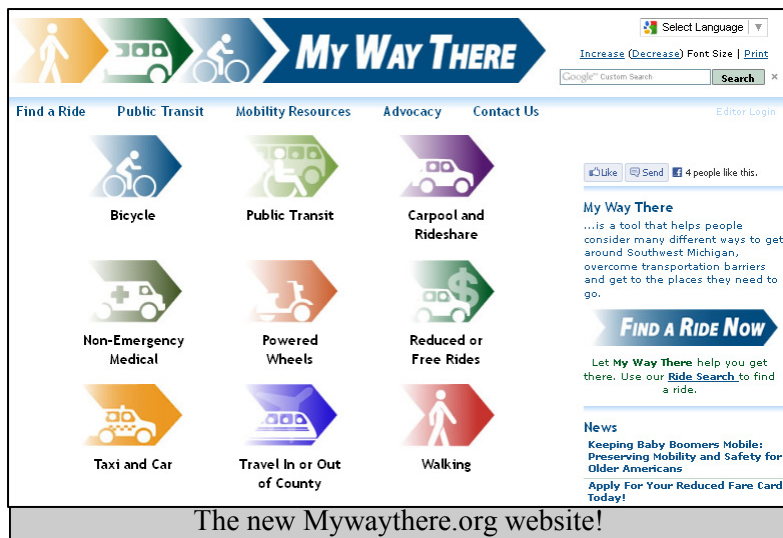
The new Mywaythere.org website!

Mywaythere.org is a website developed by the SWMPC as a one-stop resource to help find transportation options within Berrien, Cass, and Van Buren Counties. Also, human services professionals can also use Mywaythere.org to provide their clients with information about transportation options and inform clients about several free and reduced programs available to eligible seniors, students, veterans, and persons with disabilities. The free and reduced programs include senior shopping shuttles, the Disabled American Veterans medical shuttle, student summer passes, and the 50% reduced fare card program. Increasing awareness about these programs helps people address many transportation barriers when accessing employment, education and training, grocery shopping, medical appointments and other life enhancing activities or events.