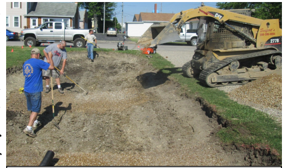
Garden site where the pea stone is being laid as a base to help water percolate into the ground.

The Jimmy F New Foundation awarded a grant to promote clean water by developing rain gardens. The Village of Three Oaks had the best attendance at the Low Impact Development Workshop held by SWMPC on March 1st and were presented a $600 Cardno JFNew Native Plant Nursery gift certificate to assist their rain garden project. On June 9th, after a great deal of planning and coordination, volunteers from Sunflower Garden Club , SWMPC, David Krumrie, the Masons and the Village and Township of Three Oaks constructed and planted the garden with a variety of native plants. The rain garden is located next to the new Three Oaks Community