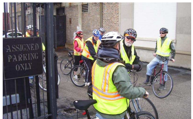
SWMPC 2010 Edition 3