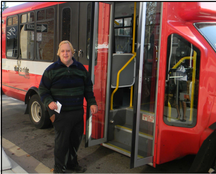
Residents use transit to get around the county.

In an effort to improve transit service to residents, the Southwest Michigan Planning Commission have selected KFH Group to conduct a study of countywide transit needs, with scenarios of how those needs could be met by various levels of coordination or consolidation of transit services throughout Berrien County. To initiate the Berrien County Transit Consolidation Feasibility Study, a kick-off meeting was held on June 1, 2011 with key stakeholders throughout the County. This meeting provided an opportunity for local discussion both during the meeting, and by the completion of a questionnaire. This detailed input will be used as a foundation for future work on the study.