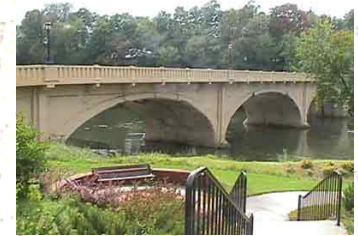
St. Joseph River

What does YOUR Green Infrastructure look like?