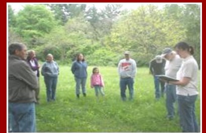
SWMPC partnered with the Van Buren Conservation District on a Wetland Wonders Tour for local officials in celebration of World Wetlands Day.

SWMPC is a member of the Lake Michigan Watershed Academy (LMWA) along with other regional planning commissions with watersheds contributing to Lake Michigan. SWMPC received a $10,000 grant from LMWA to support watershed efforts in southwest Michigan. The Lake Michigan Watershed Academy's website highlights regional projects. www.lakemichiganacademy.org