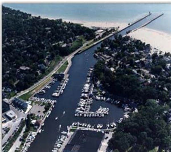
City of South Haven

-The final section addresses city policies and provides concrete policies to enact the vision and goals of the plan. A future land use map is included in the plan.