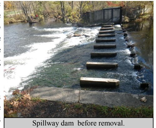
Spillway dam before removal.

This fall a major restoration project was completed on the Paw Paw River in Watervliet. The spillway and diversion dams located east of M-140 were removed. The removal will result in cleaner water, improved fish and aquatic habitat, and a safer experience for river users. The project also included the restoration of the river channel, repair of the stream banks, and landscaping with native trees and shrubs.