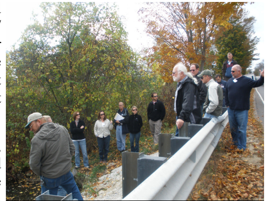
Road/stream crossing in Cass County

FotSJR hosted a workshop offering guidance on properly assessing, designing and installing/replacing culverts to reduce erosion and extend culvert life. Workshop attendees enjoyed a field trip where they visited and discussed impacts of dams and design considerations of good and bad road/stream crossings. A road/stream crossing on Redfield Road in Cass County was visited. This structure is planned for replacement in 2012 and will be an excellent showcase of a well designed road/stream crossing.