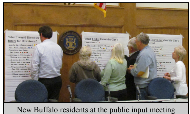
New Buffalo residents at the public input meeting

For more information visit www.swmpc.org/newbuffalo.asp